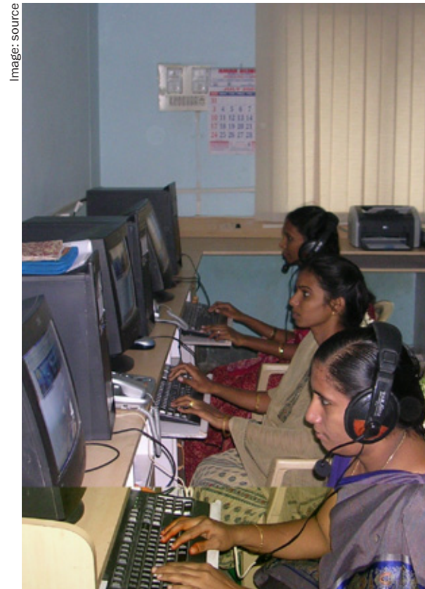
A call centre for Grievance Redressal in a municipality

An interesting pilot scheme has been started by CGG in the residential schools for poor children from disadvantaged sections of the society