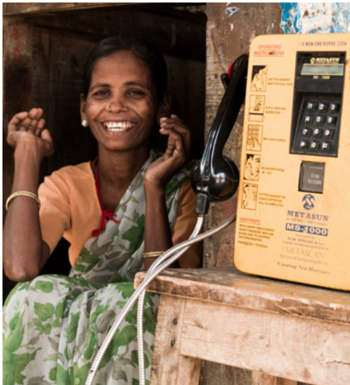
Initiatives by the Centre for Good Governance are focussed on improving communications technology for the poor